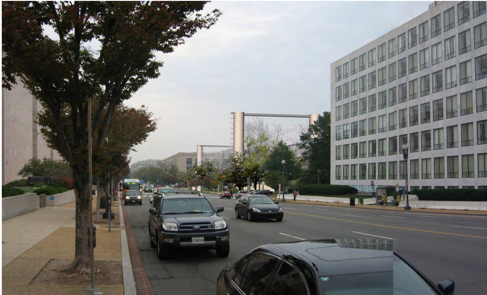
SIDEWALK VIEW LOOKING SOUTHEAST TOWARDS THE MEMORIAL

This contextual image illustrates the adjacent structures to the Memorial. The Memorial column is placed within the context of the broken street wall and provides a visual marker for the Memorial design. The placement of the column, in conjunction with the landscape design and new tree planting scheme, allows for a connection of new streetscape development along Independence Avenue.